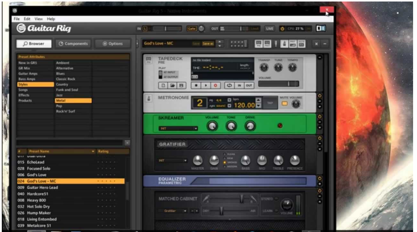
FULL Native Instruments Guitar Rig 5 Pro V5.2.2 UNLOCKED - R2R